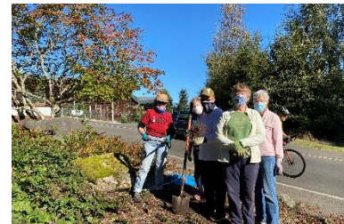
TGC crew working at the Native Plant Garden

2,000 hours of volunteer time each year tending the garden in conjunction with Parks Tacoma.