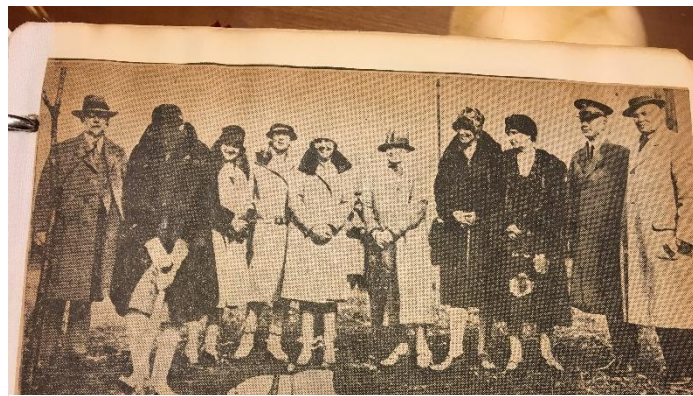
Planting the Boulevard of Remembrance in 1928

True to the mission of both the GCA and TGC, members began at once to work on conservation and the beautification of civic spaces. Early projects included: contributing to saving stands of timber; preparing a city ordinance protesting cutting of trees in parking strips, which the Tacoma City Council accepted; decorating downtown Tacoma with “living Christmas trees”; and in 1928 to commemorate the memory of those who fought in World War I, planting a Boulevard of Remembrance with red oaks ( Quercus rubra ) and shrubs for several miles from north of the Nisqually River through Camp Lewis. In 2016 signs were installed along I-5 marking the northern and southern boundaries of these original plantings. A commemorative plaque, bench, and red oaks were installed by TGC at the Fort Lewis Museum in 2017.