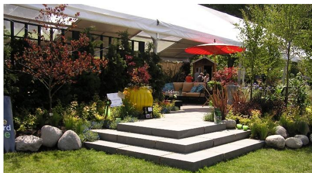
PDFGS Display Garden

In 2005 Tacoma Garden Club was a founding force (providing key leadership, volunteers, and financial support) with Parks Tacoma in creating the Point Defiance Flower and Garden Show. The first PDFGS was held in 2006. The mission of the show was to provide a variety of educational opportunities for the public and to help raise money for park equipment and the refurbishment of the Japanese Garden.